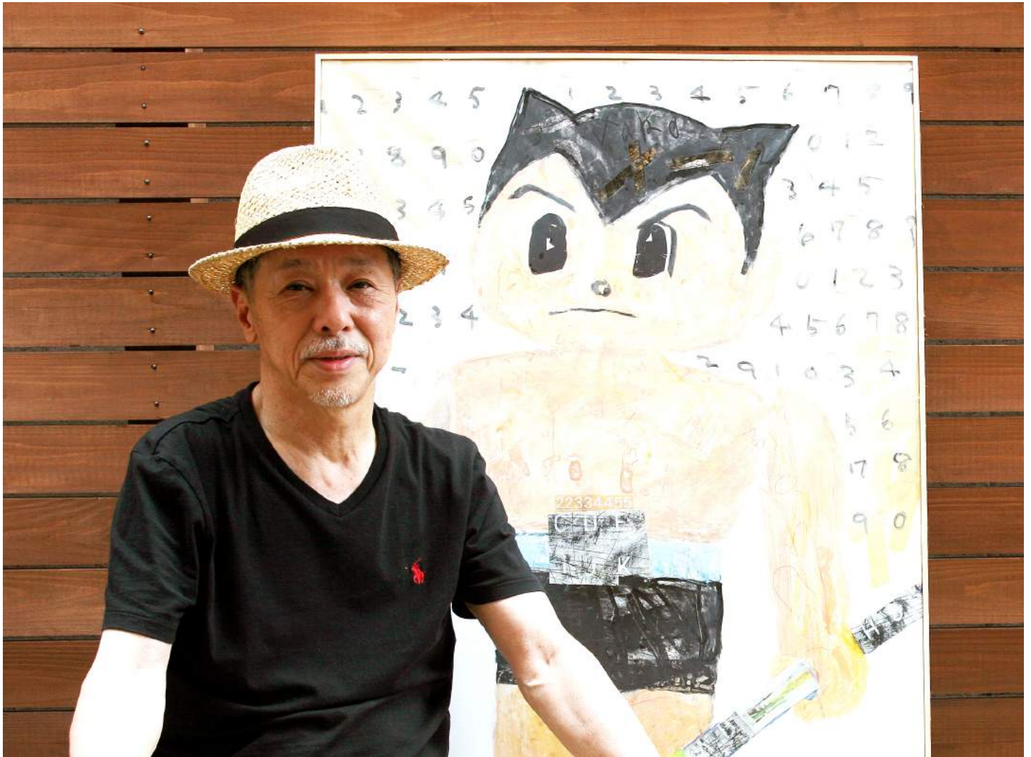
Portrait “Come on! Never give up!”