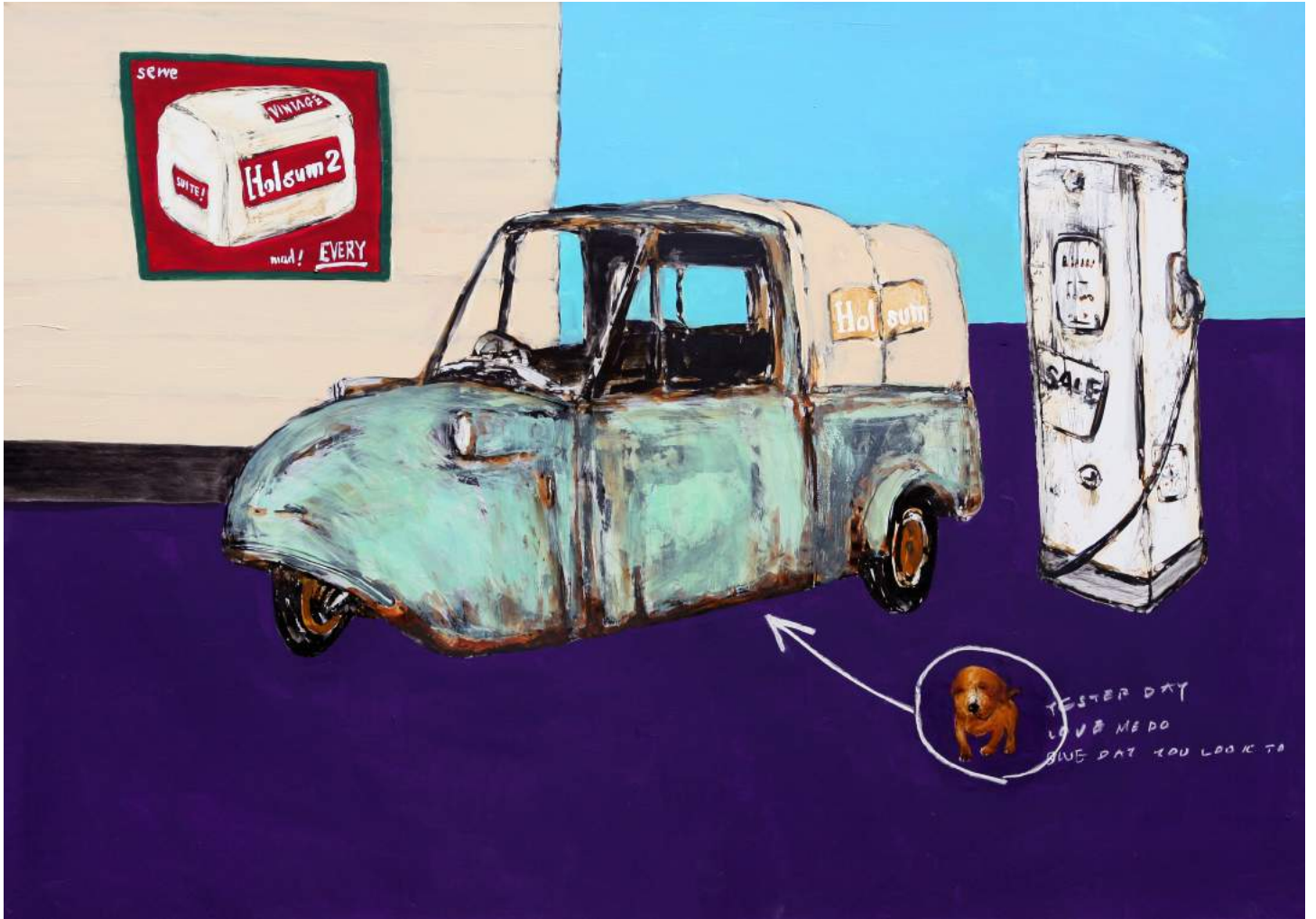
The rusty Daihatsu Midget

73 x 103 cm India ink water colors acrylics pastel