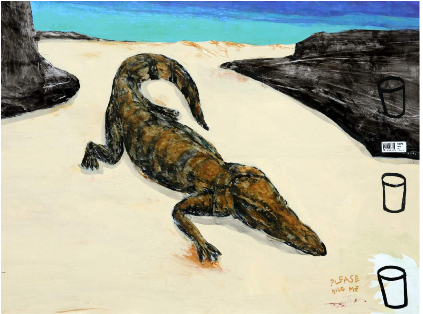
A lastly-dying crocodile (Please give me a cup of water) 55 x 73 cm India ink water colors acrylics pastel