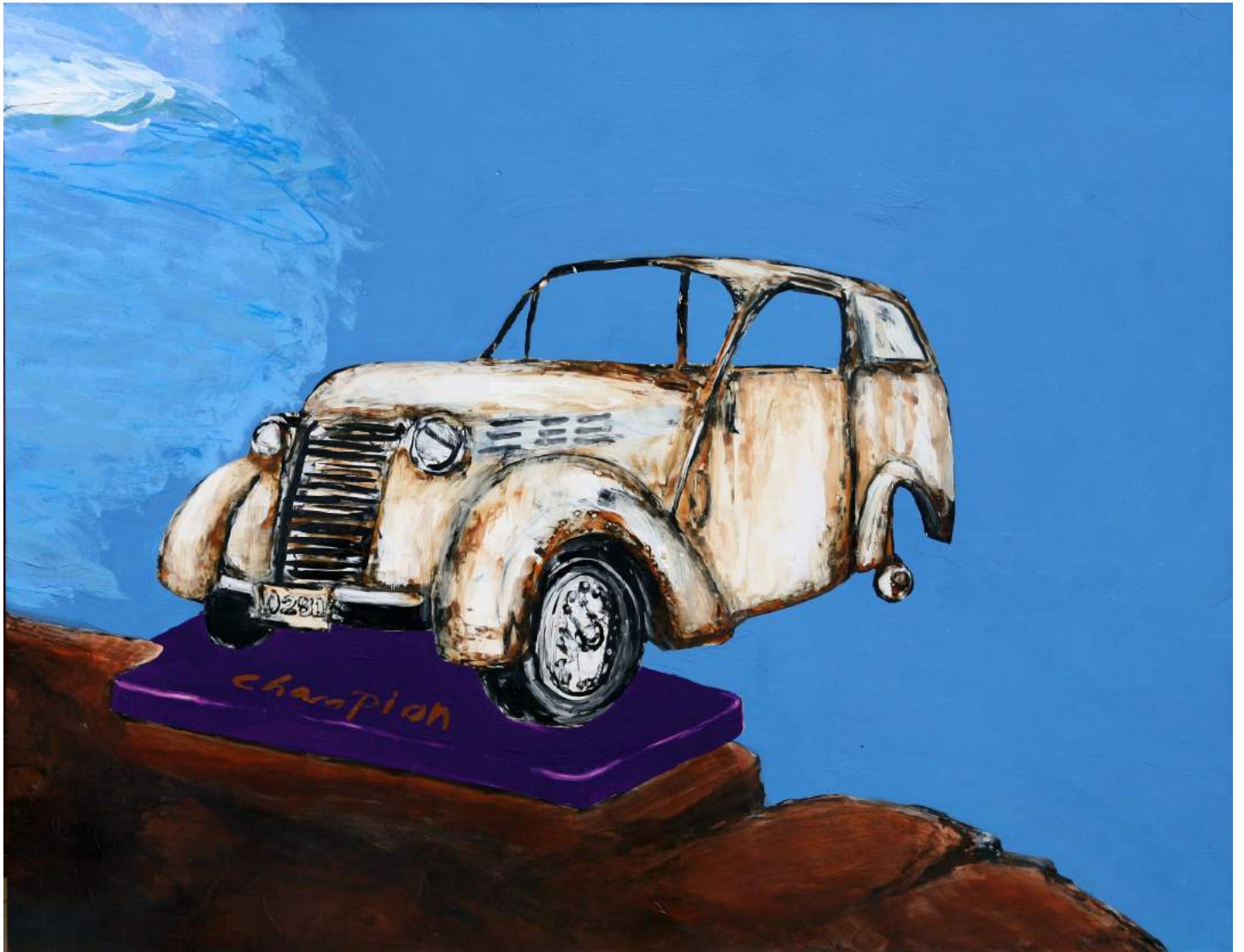
A rust-eaten artwork (An antiquity of the past human race) 64 x 85 cm India ink water colors acrylics pastel