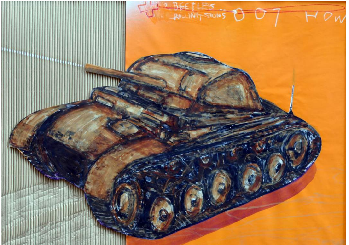
A rust-eaten tank

66 x 85 cm India ink water colors acrylics pastel cardboard