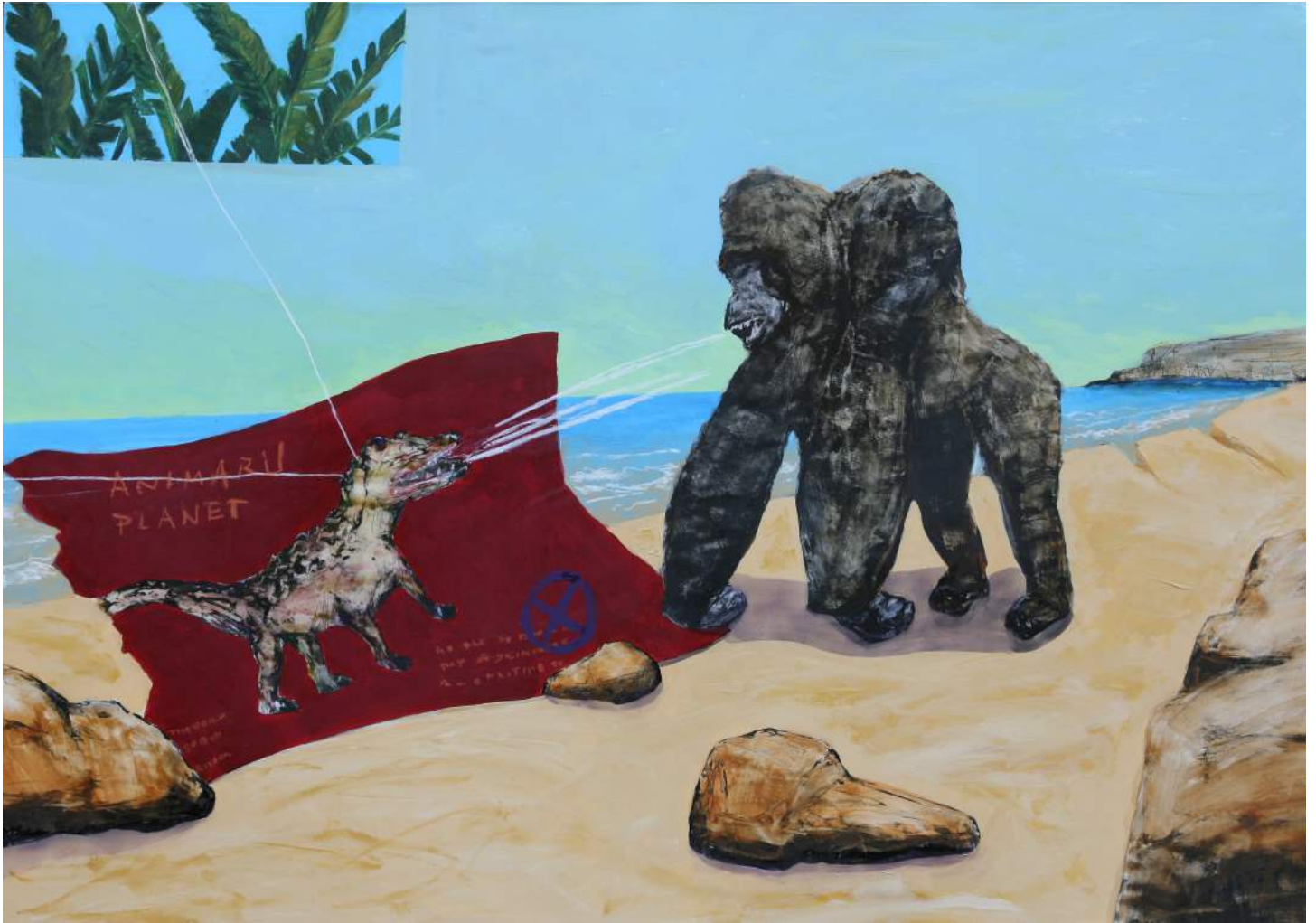
An ancient crocodile fights against a gorilla

73 x 103 cm India ink water colors acrylics pastel