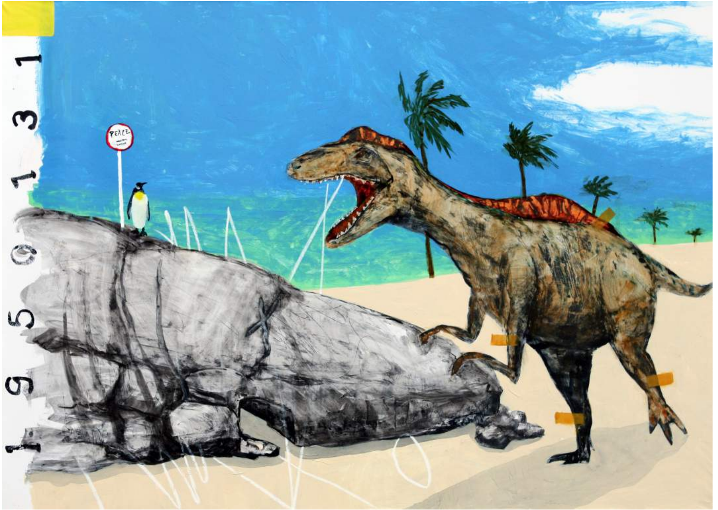
A dinosaur attacks a penguin

73 x 103 cm India ink water colors acrylics pastel