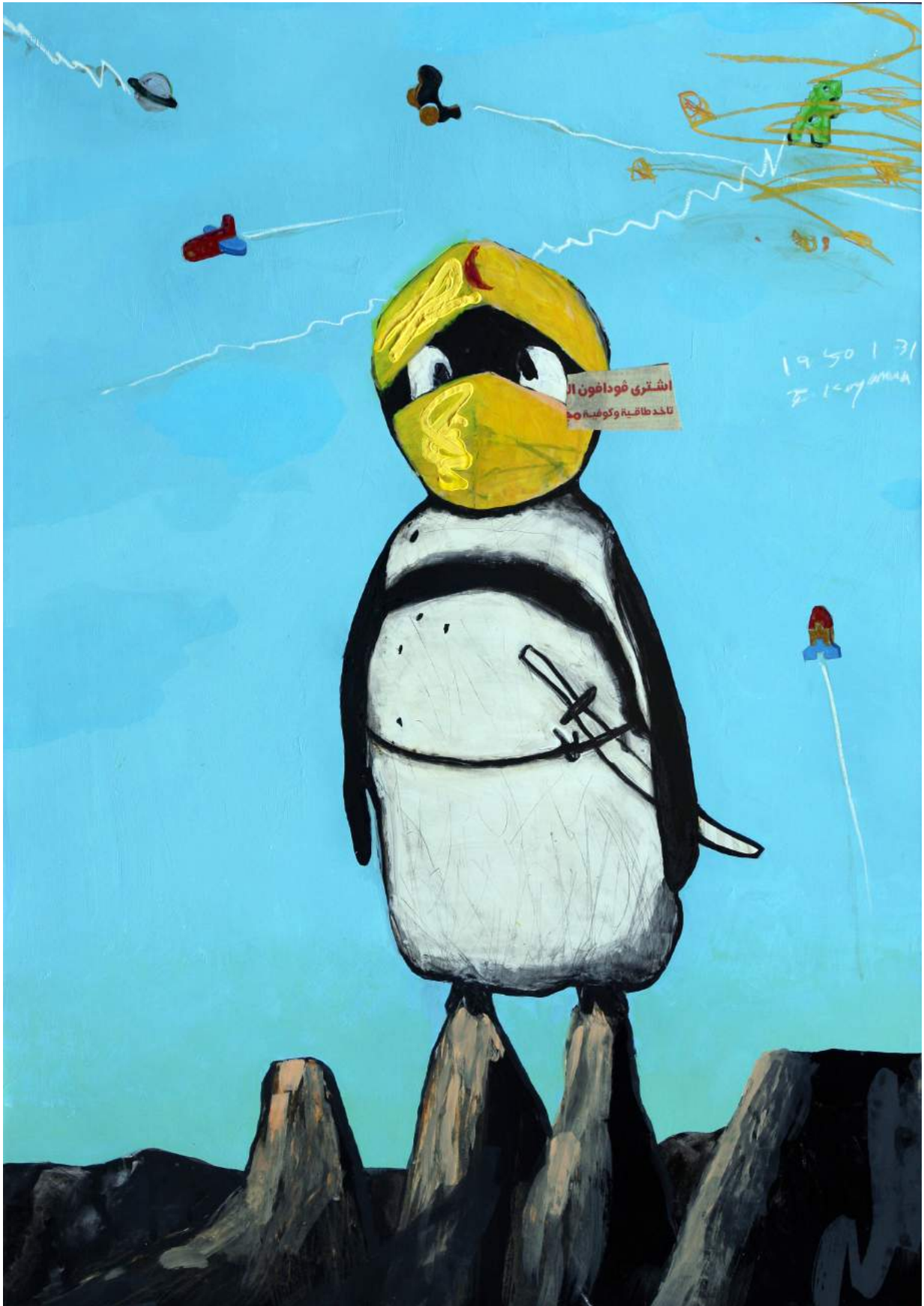
A Moon Masked Rider in the future

103 x 73 cm India ink acrylics pastel collage