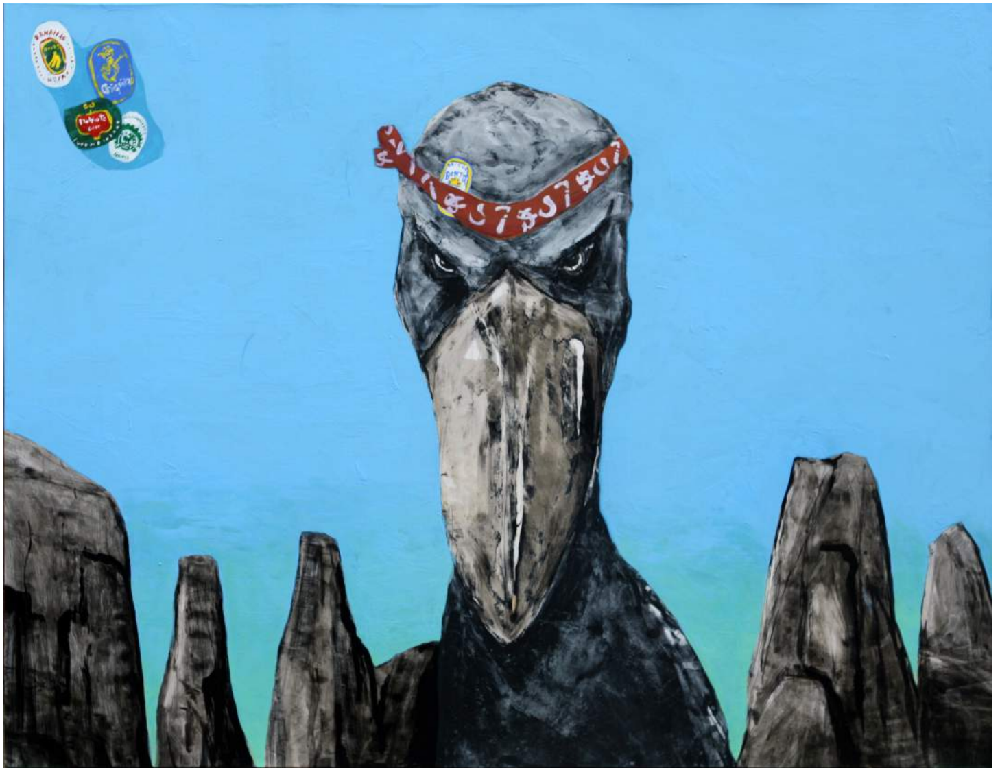
The Boss (Reptile takes a position as monarch on the Earth) 66 x 85 cm India ink acrylics