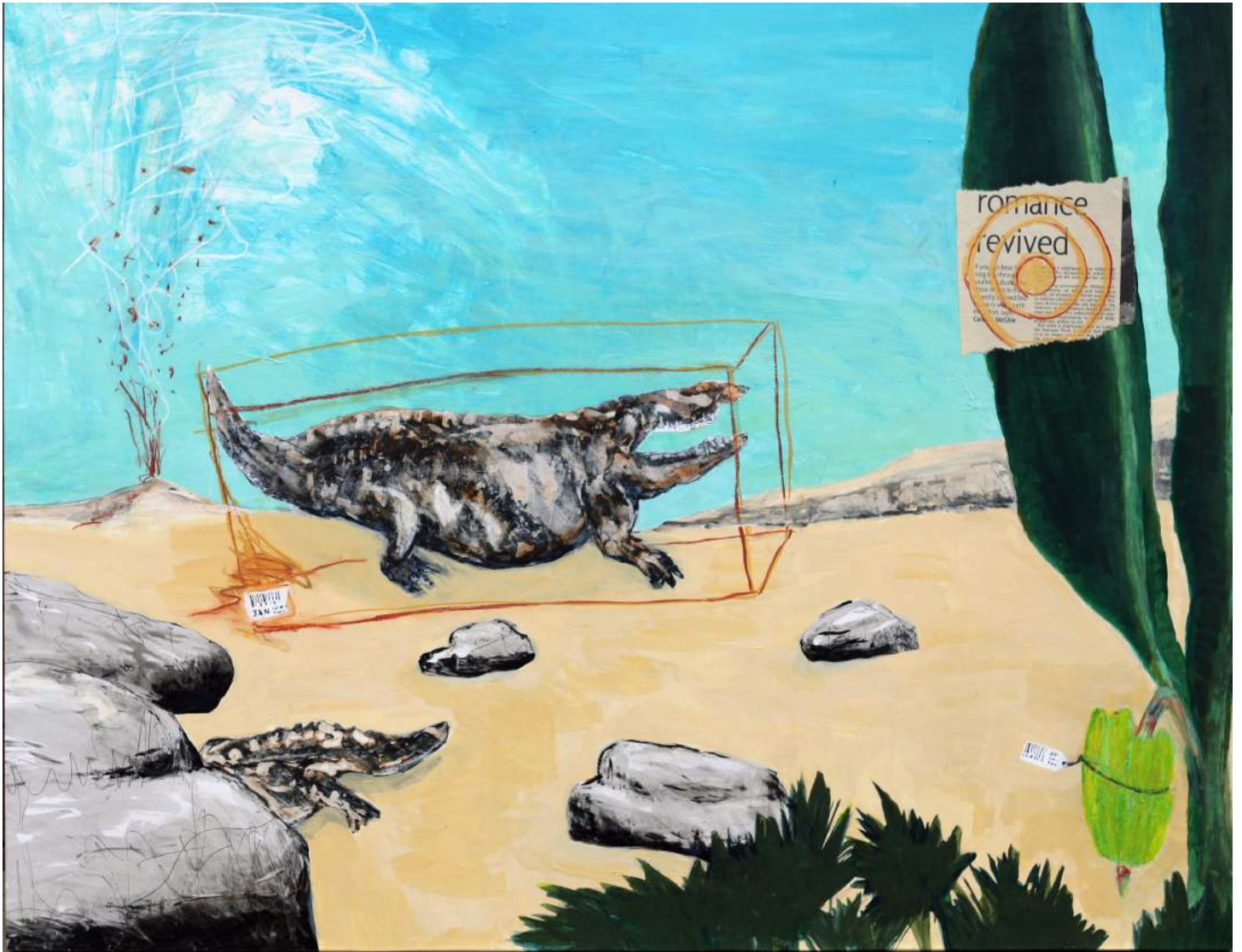
A land view after the ecological revival on the earth (Two crocodiles of new species) 66 x 85 cm India ink water colors acrylics pastel collage